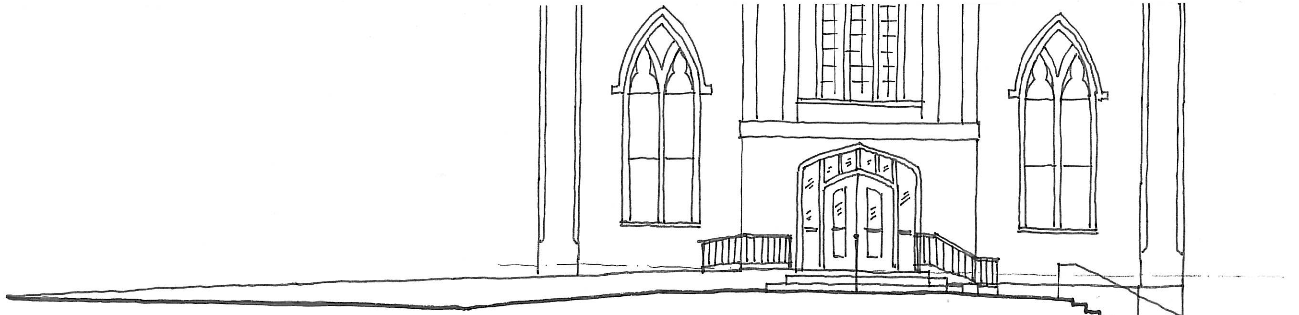
○ PART ELEVATION @ FRONT (MAIN) ENTRANCE SCALE: 1/8" = 1'-0"